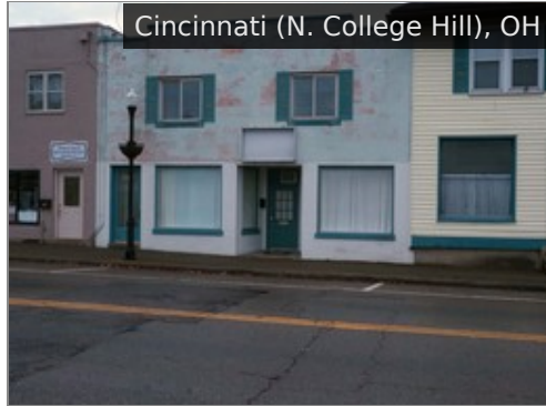
Cincinnati (N. College Hill), OH

1619 W. Galbraith Rd. 1,230 SF for Lease