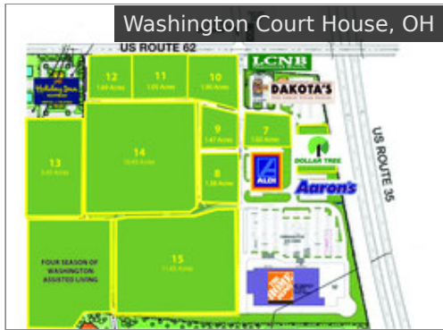
US 35 & US 62 Subject To Offer