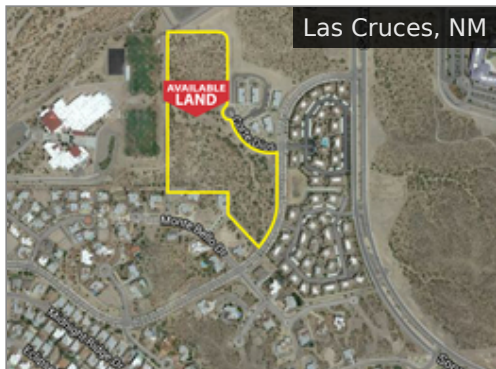
3500 Morning Star Subject To Offer