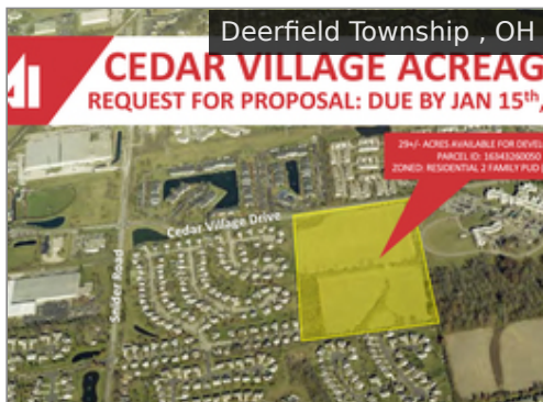
Deerfield Township, OH

29+/- Acres : Cedar Village Drive Subject To Offer