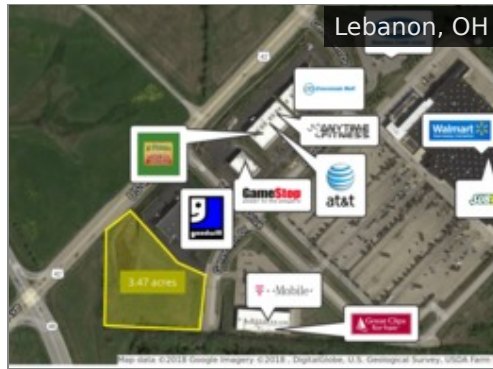
US 42 and SR 48 $350,000