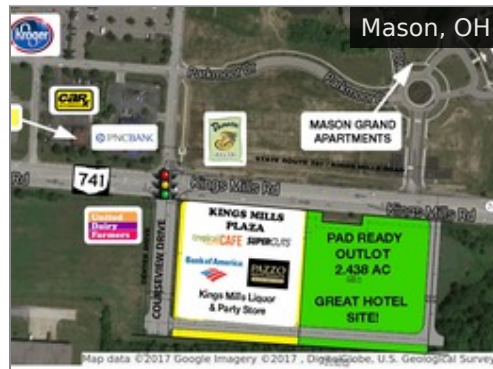
KINGS MILLS PLAZA - LOT 4 Subject To Offer