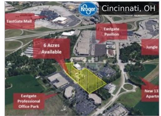
4427 Aicholtz Rd $200,000 / acre