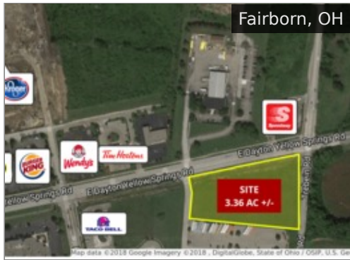
1360 Dayton Yellow Springs Rd 3.36 Acres for Lease