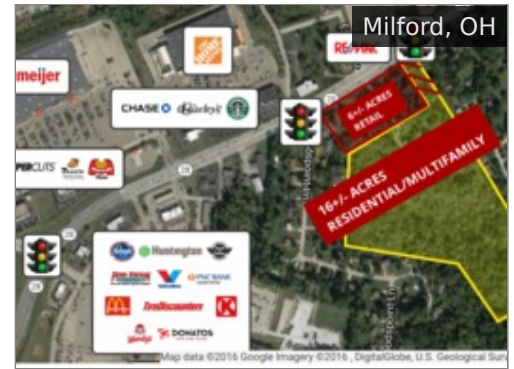
1153-1163 State Route 28 Off Market