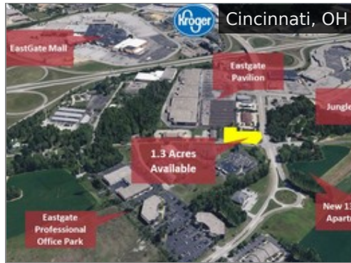
4414 Aicholtz Rd $300,000 / acre