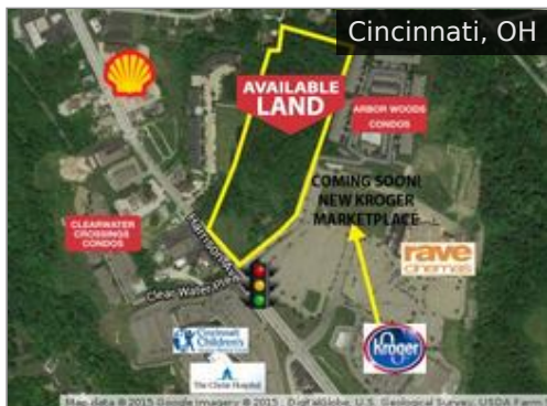
5922 Harrison Ave $1,463,400