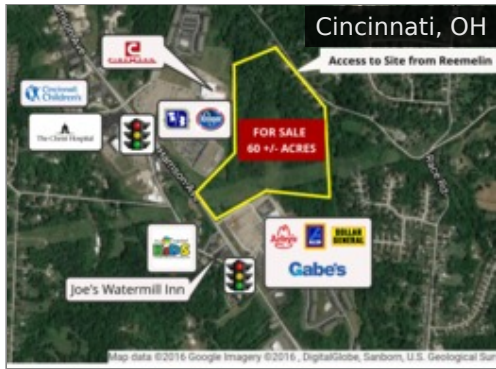
5750 Harrison Ave Subject To Offer