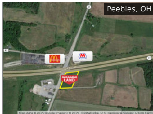
1 Adams Way $175,000