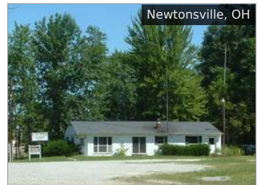
785 SR 131 (Wright St) $275,000