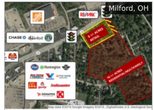
1153-1163 State Route 28 Off Market