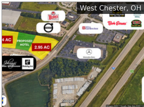
NW Corner - Muhlhauser Road & 4066 Mt. Carmel Subject To Offer