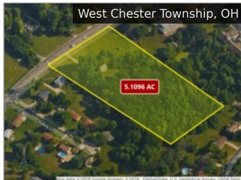
West Chester Township, OH