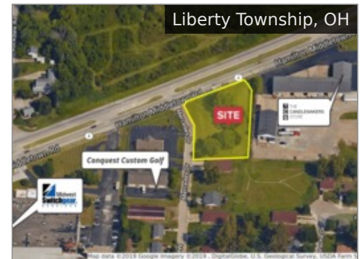
4874 Mercedes Dr. $199,000 / acre