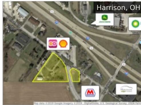
10005 Harrison Ave. $230,000 / acre