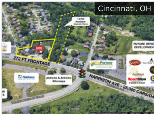
5581 Harrison Avenue Subject To Offer