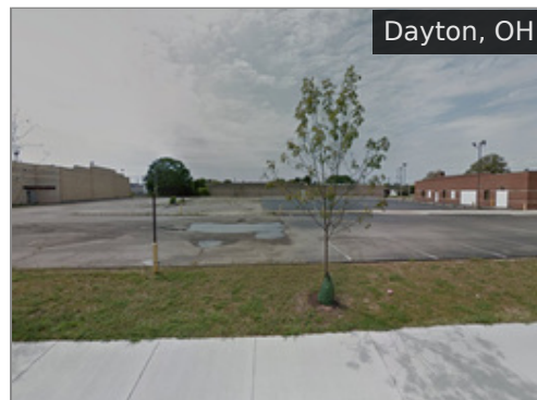
1303 Keowee Street $99,000