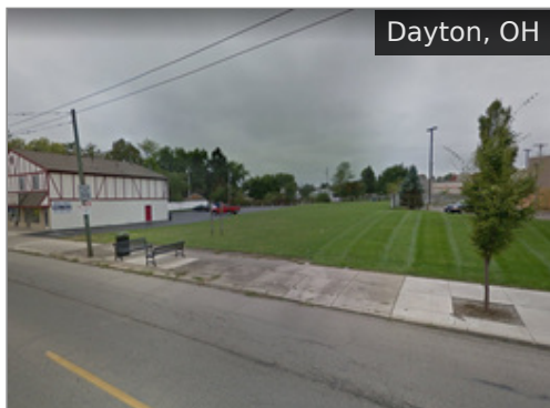
2610 Grampfer Lane $50,000