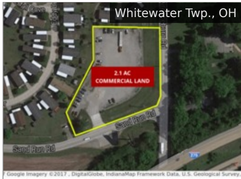
4727 Lawrenceburg Road Subject To Offer