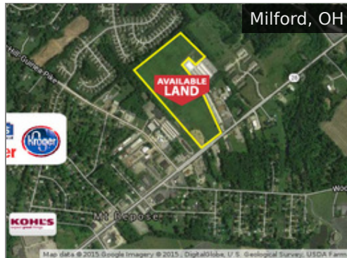
1282 State Route 28 Subject To Offer