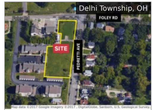
Pedretti Avenue & Foley Road