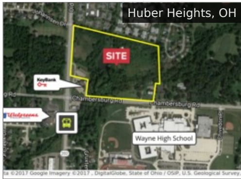
6502 Old Troy Pike $675,000