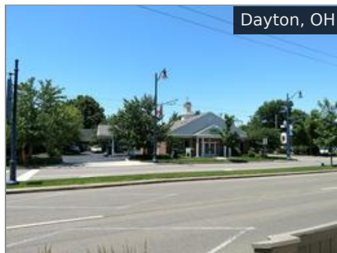
2705 Far Hills Ave $975,000