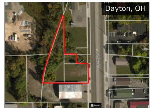
9001 N Dixie Dr $25,000