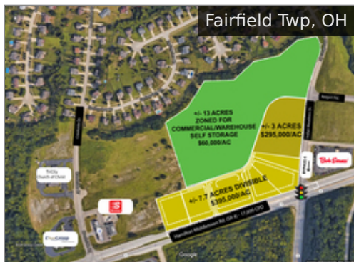
SR 4 at Indian Meadows Dr.