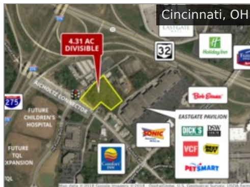
Aicholtz Rd. and Omni Dr.