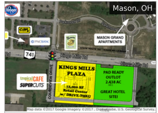
KINGS MILLS PLAZA - LOT 4 Subject To Offer