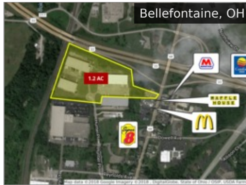
1133 Main St