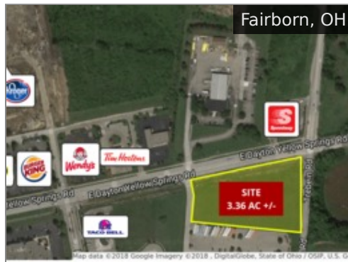
1360 Dayton Yellow Springs Rd