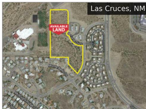
3500 Morning Star