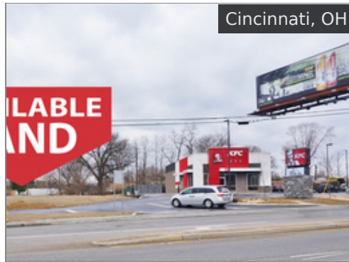
8325 Colerain Avenue