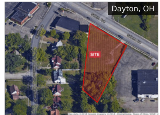
4464 Salem Ave $25,000