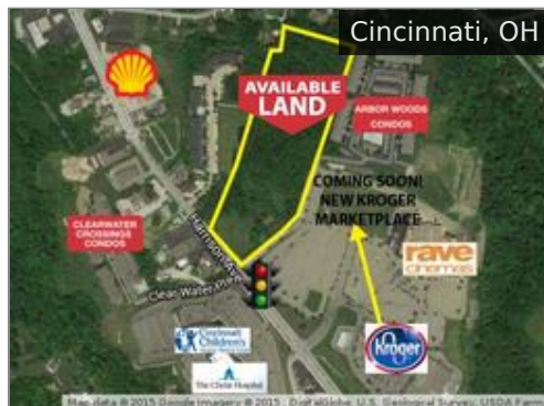
5922 Harrison Ave $1,463,400