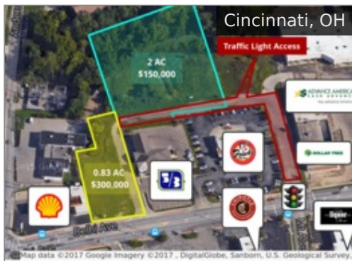
5262 Delhi Pike $150,000 - $300,000