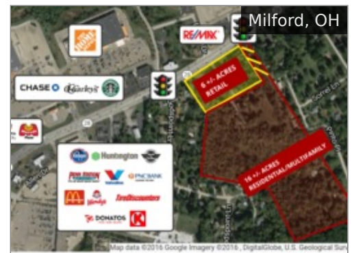
1153-1163 State Route 28 Subject To Offer