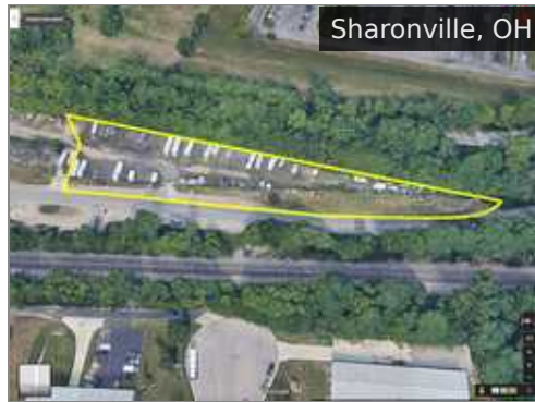
Storage Yard - Drop Lot call agent