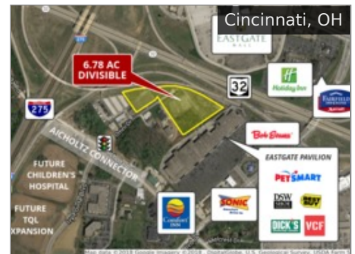
3232 Omni Dr.