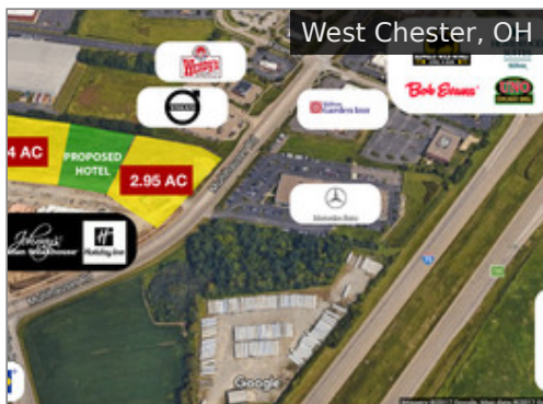
NW Corner - Muhlhauser Road & I-75 Subject To Offer