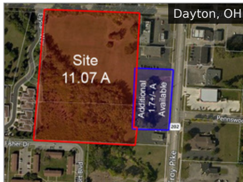
5881 Old Troy Pk $299,000