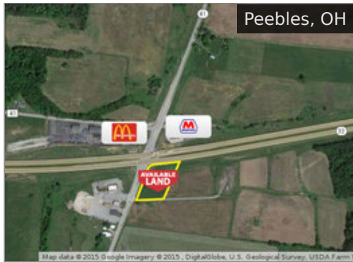
1 Adams Way