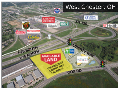
THE FIELDS AT LIBERTY WAY - L Subject To Offer