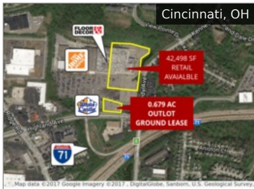
3430 Highland Ave.