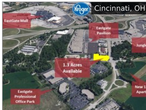
4414 Aicholtz Rd