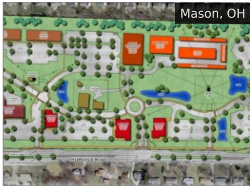
710 Tylersville Road