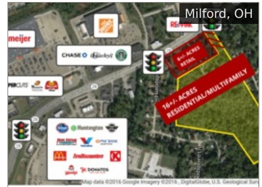
1153-1163 State Route 28 $50,000 / acre