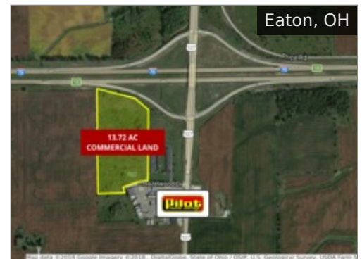
6141 US 127 $195,000