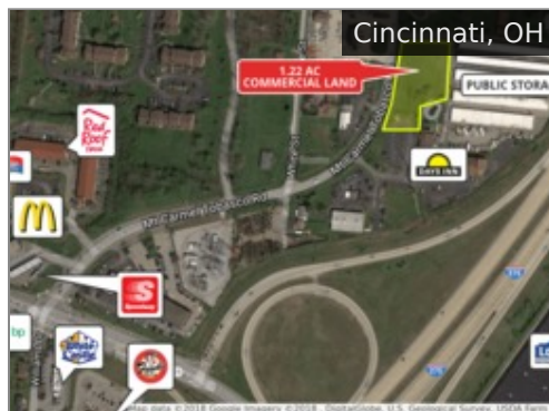
4066 Mt. Carmel Tobasco Rd. $240,000