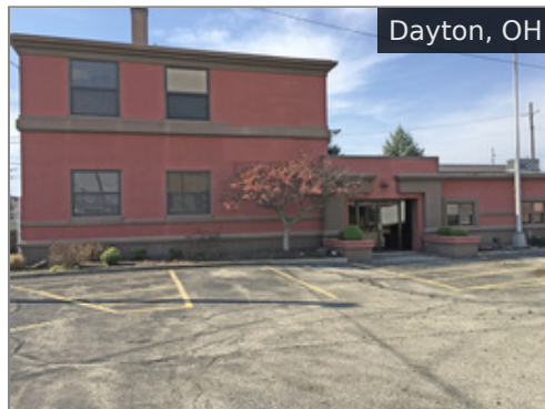
1247 Leo Street Subject To Offer