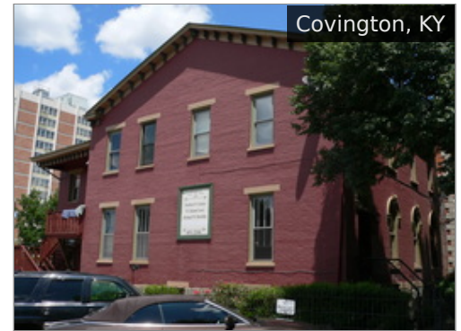
120-122 W. 5th Street $525,000