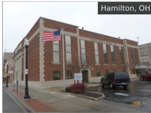
100 S. 3rd St. $820,000