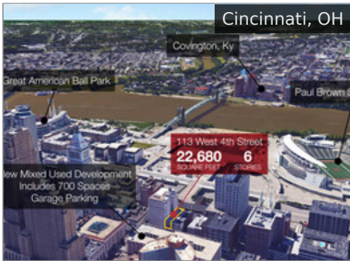
113 West 4th Street Subject To Offer