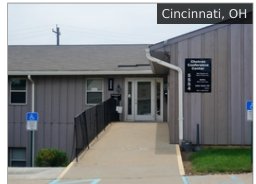
5554 Cheviot Road $650,000