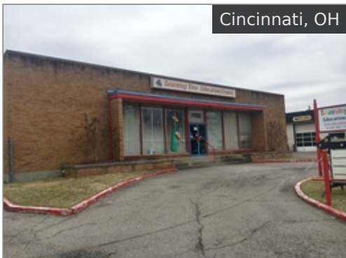
7762 Reading Rd $575,000