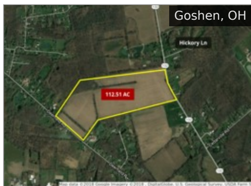
State Route 132 $1,632,000