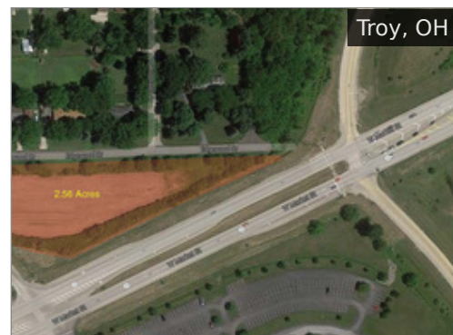
1403 W Market Street $325,000