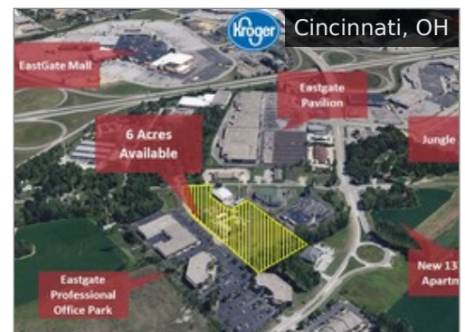
4427 Aicholtz Rd $200,000 / acre