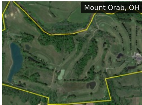
5510 Tri County Hwy Off Market