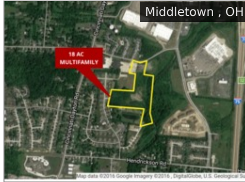
6913 Lefferson Rd Subject To Offer