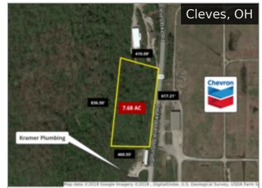
4525 State Route 128 Subject To Offer