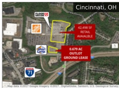
3430 Highland Ave. 0.679 Acres for Lease