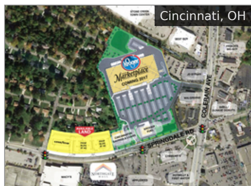
Springdale Rd. & Colerain Ave. Subject To Offer