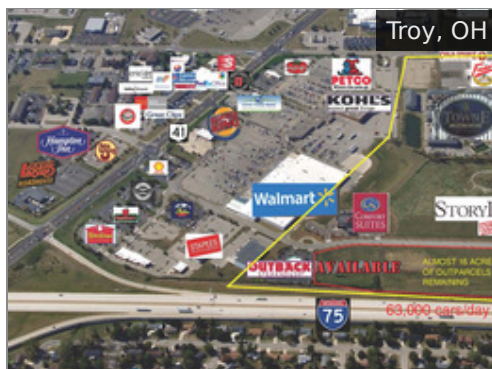
Towne Park Drive Subject To Offer