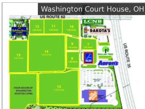
US 35 & US 62 Subject To Offer