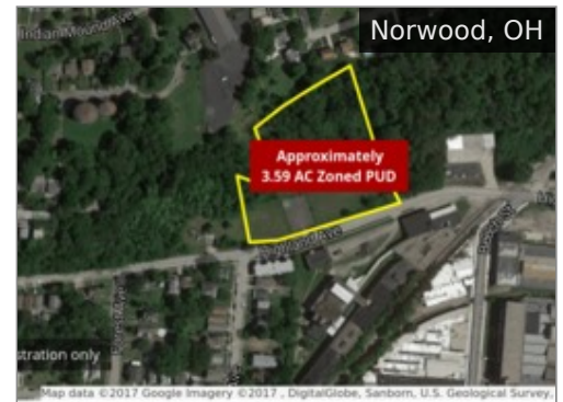
2510 Highland Avenue $150,000