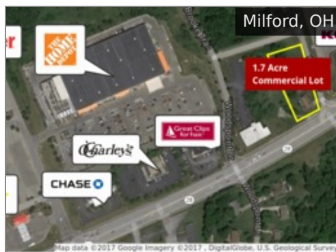
1154 State Route 28 Subject To Offer