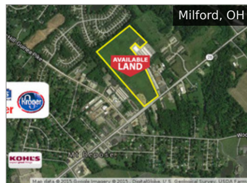
1282 State Route 28 Subject To Offer