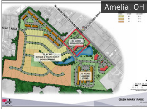
SR 125 (Ohio Pike) W. Main St. $225,000 - $425,000