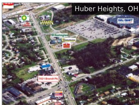
7521-7525 Brandt Pike $890,000