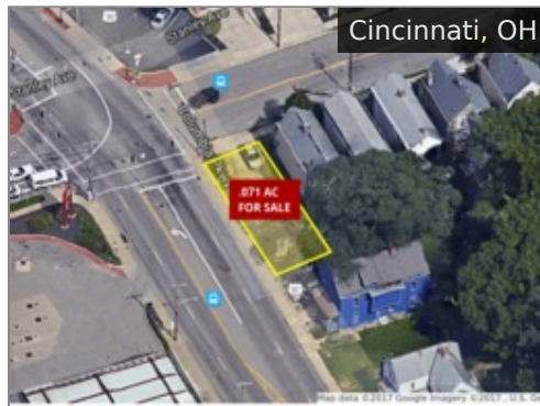
400 Stanley Avenue $100,000