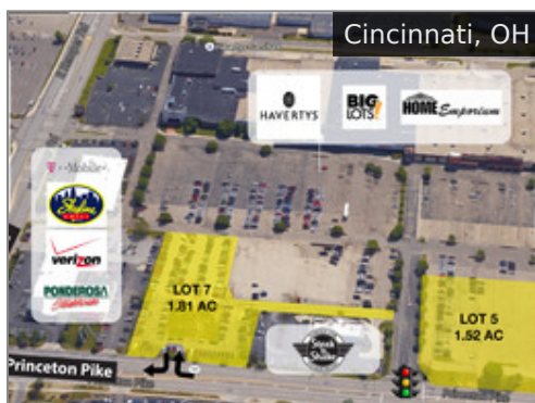
E Kemper Rd and Princeton Pike $495,000