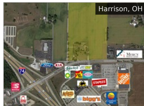
10588 New Haven Rd Subject To Offer