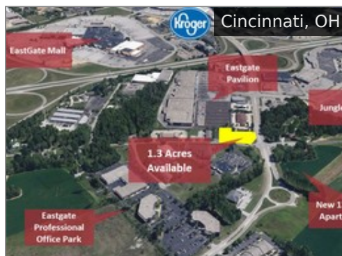
4414 Aicholtz Rd $300,000 / acre