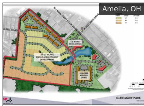
SR 125 (Ohio Pike) W. Main St. Subject To Offer