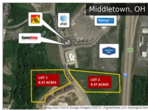
2661 Towne Blvd. Subject To Offer