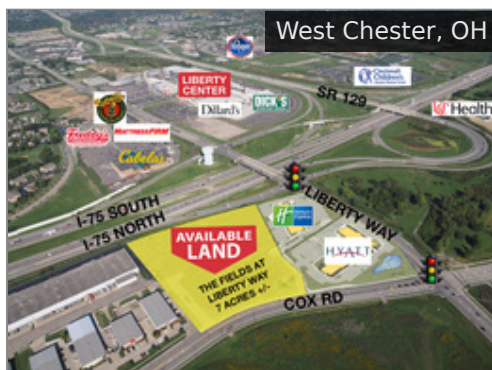
THE FIELDS AT LIBERTY WAY - L Subject To Offer