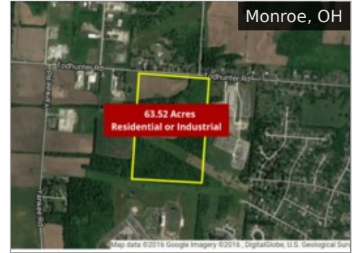
700 Todhunter Road Subject To Offer