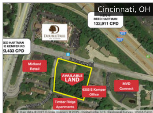
6237 - 6259 East Kemper $695,000