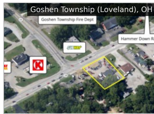
1601 State Route 28 Subject To Offer