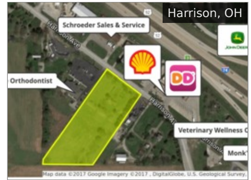
10047 Harrison Ave $125,000 / acre