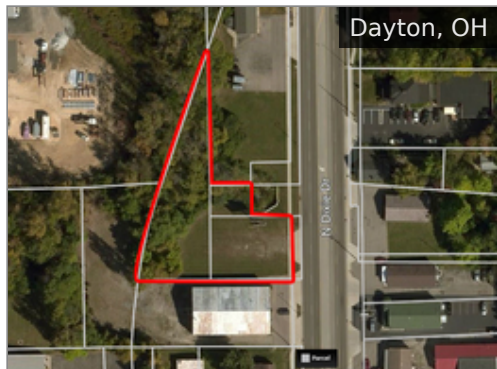
9001 N Dixie Dr $49,500