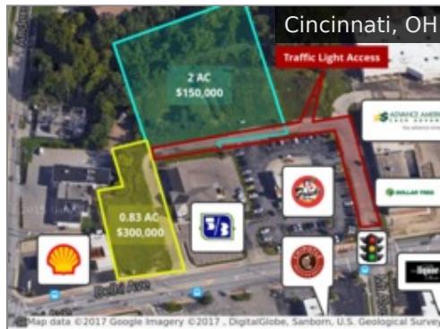
5262 Delhi Pike $150,000 - $300,000