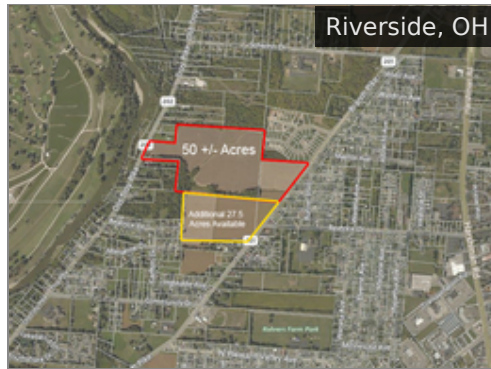
3730 Old Troy Pike $1,500,000