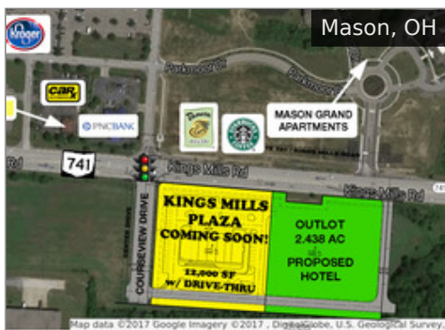
KINGS MILLS PLAZA - LOT 4 $750,000