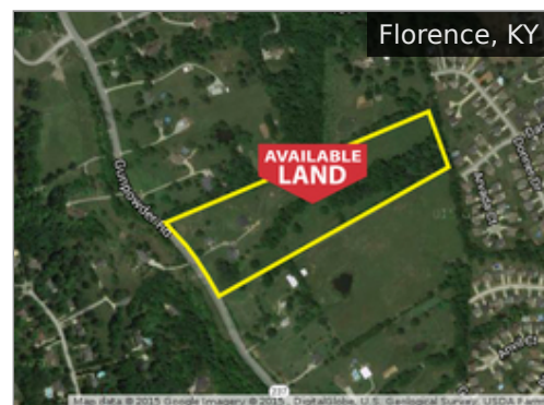
9600 Gunpowder Road Call for Offers - Residential Lot Development