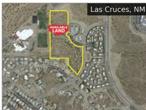
3500 Morning Star Subject To Offer